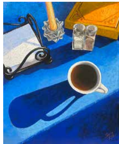
The Morning Stretch , 24 x 18, Pastel on Textured Board

betsy@betsypaynecook.com or 508-737-7480