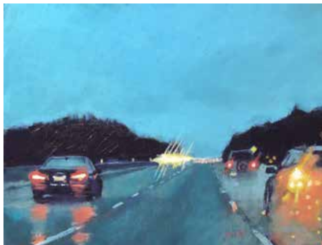
Almost Home II, Pastel